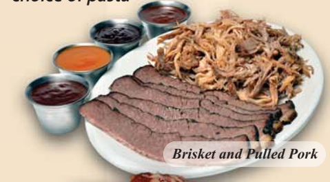
Brisket and Pulled Pork