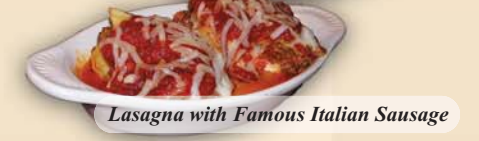
Lasagna with Famous Italian Sausage