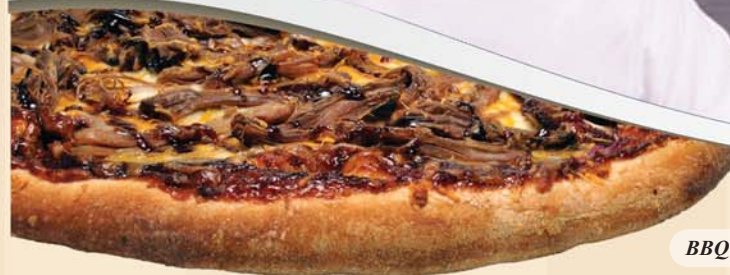
BBQ Pulled Pork Pizza